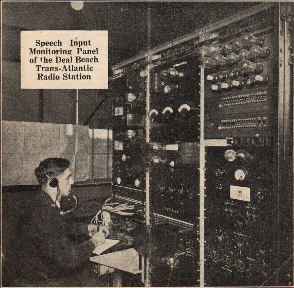
Speech Input Monitoring Panel of the Deal Beach Trans-Atlantic Radio Station